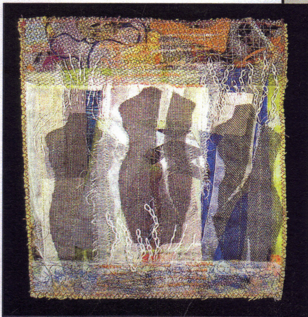
CHRISTINE SAUER New Orleans, Louisiana Three Torsos Commercial fabrics, window screen, cotton floss, collage, machine stitching, hand embroidery 12" x 11", 2007