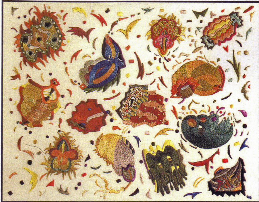
PAT KLEIN Ivyland, Pennsylvania Number Five Hand-stitched cotton thread on linen 24.75" x 28.75"